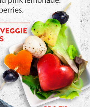
CUPID'S VEGGIE SKEWERS

PRO TIP: Use a small heart shaped cookie cutter to create perfect hearts