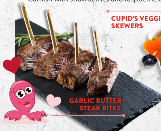
GARLIC BUTTER STEAK BITES