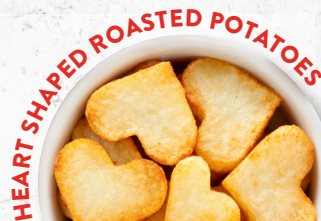
HEART SHAPED ROASTED POTATOES

Mix equal parts lemon lime soda and pink lemonade. Garnish with strawberries and raspberries.