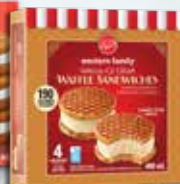
Cookie Ice Cream Sandwiches