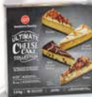
Ultimate Cheesecake Collection 16 pre-cut slices, 1.4 kg