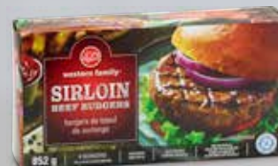
Sirloin Burgers 852g