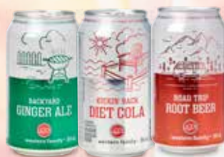
Soft Drinks 12x355 mL