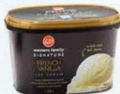
Signature French Vanilla Ice Cream , 1.65 Litres

Here are a few of our Western Family favourites: