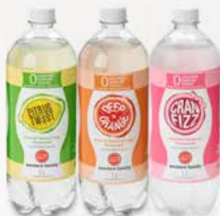
Sparkling Water 1 Litre

With rising summer temperatures and sizzling hot BBQs it's time to cool things down. Sip a refreshing soda or mix up a mocktail made with sliced summer fruits and one of our sparkling seltzers.