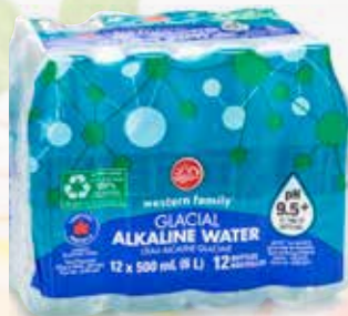
Glacial Alkaline Water 12x500 mL