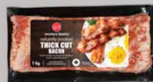
Bacon Thick Sliced, 1 kg