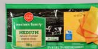
Cheese Slices 700g