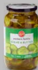
Bread & Butter Pickles 1 Litre